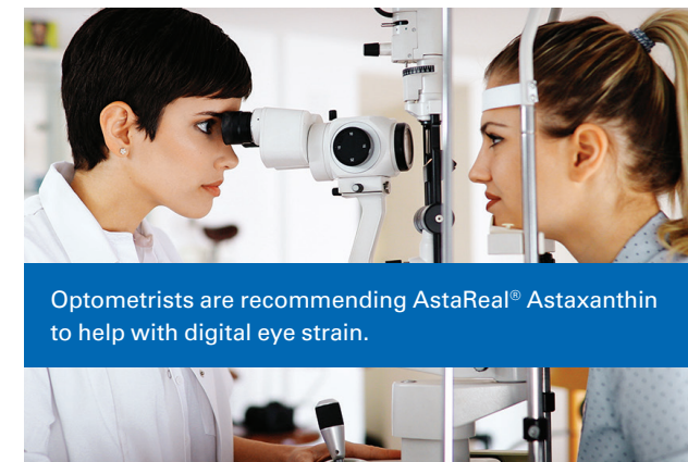
Optometrists are recommending AstaReal® Astaxanthin to help with digital eye strain.