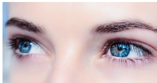
Relief From Dry Eye Solution Impresses Optometrists

Optometrists across the country are adding dry eye treatment to their core services. Getting referrals from ophthalmologists and other health care providers is easy. Yet finding an effective nutritional solution that dry eye sufferers can use over the long term is a challenge.