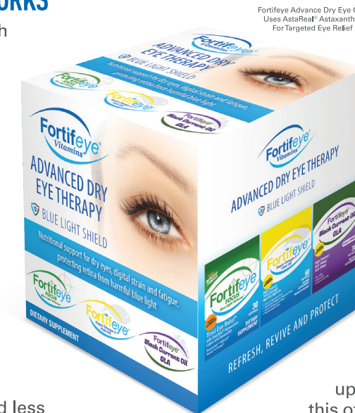
Fortifeye Advance Dry Eye Care Uses AstaReal® Astaxanthin For Targeted Eye Relief

For the first time, Fortifeye is packaging their dry eye products together as Advanced Dry Eye Therapy. Every package includes Fortifeye Focus with AstaReal® Astaxanthin along with Fortifeye Super Omega and Fortifeye Black Currant Oil/GLA.